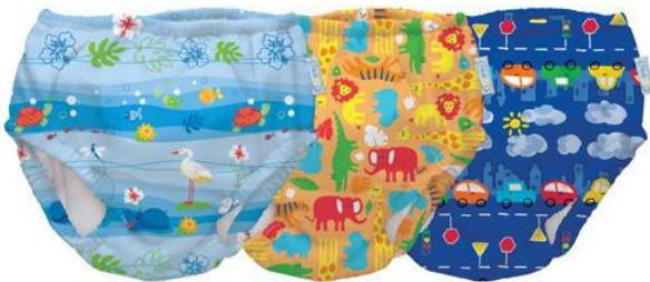
Approved Swim Diaper

Thank you for your cooperation with the enforcement of this policy and keeping our facility safe for all visitors and staff. Should you have any questions regarding these policies, please see the Pool Manager, or you may contact the Village Hall by calling (847) 658-2700 or emailing recreation@algonquin.org .